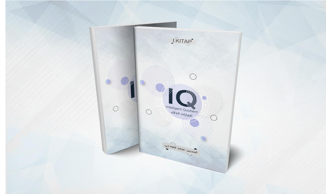
IQ (intelligence quotient) question bank 2019