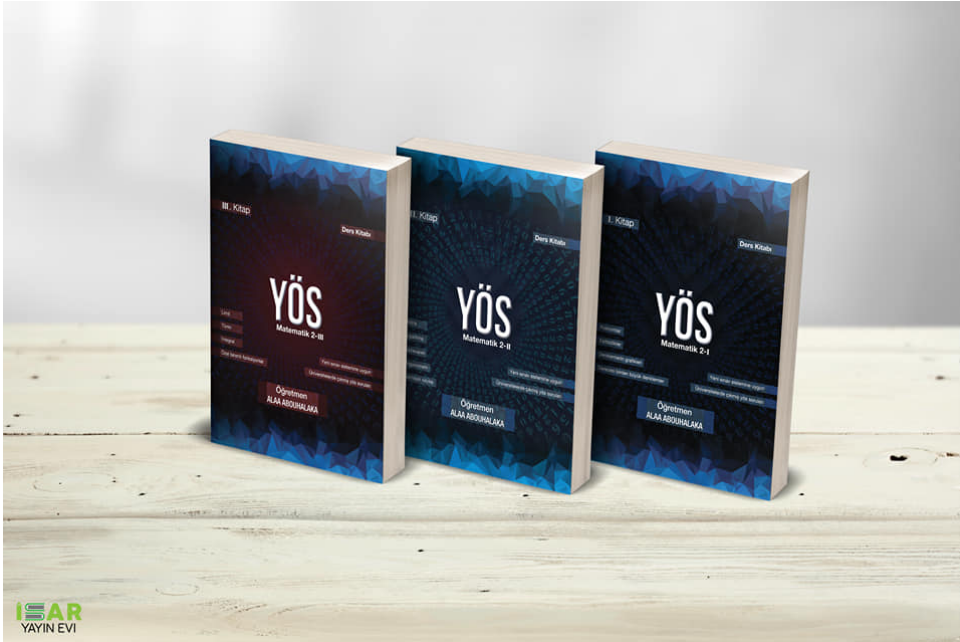
Mathematic Textbooks 2018