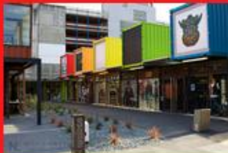
The Postnet Mall in Christchurch after the original Christchurch mall was destroyed.