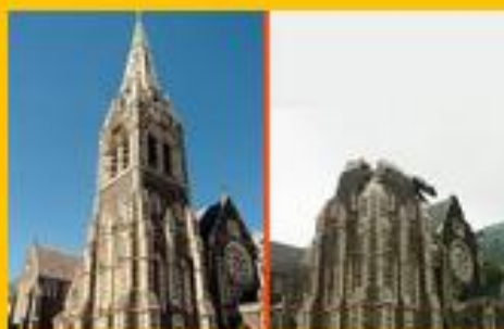
The left, my photo, but it's taken in my hometown. It's of the Christchurch cathedral, before and after the February 22nd earthquake in 2011.

Anonymous asked: Hi, just wanted to say that I think this is an awesome idea! :)