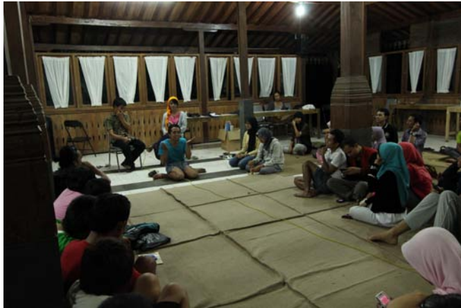
Sketch performance : Discrimination