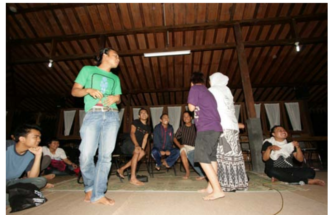
Sketch performance : Excluxivism