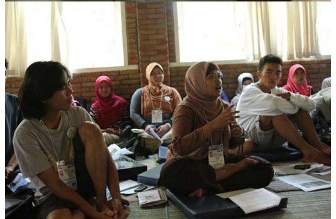
Analysis on patriarchy, heteronormative and kuriarchy