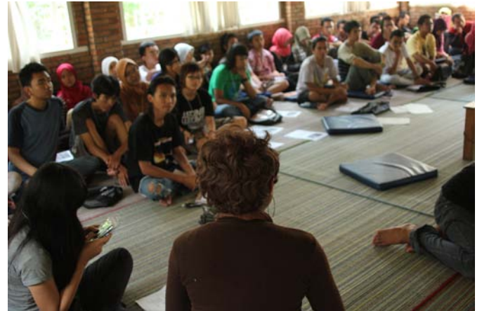
Sharing about bissu