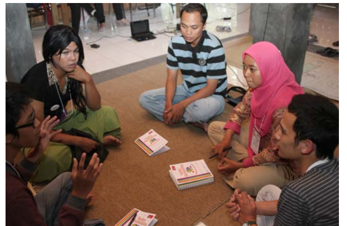
Guess the Value : Culture of Peace