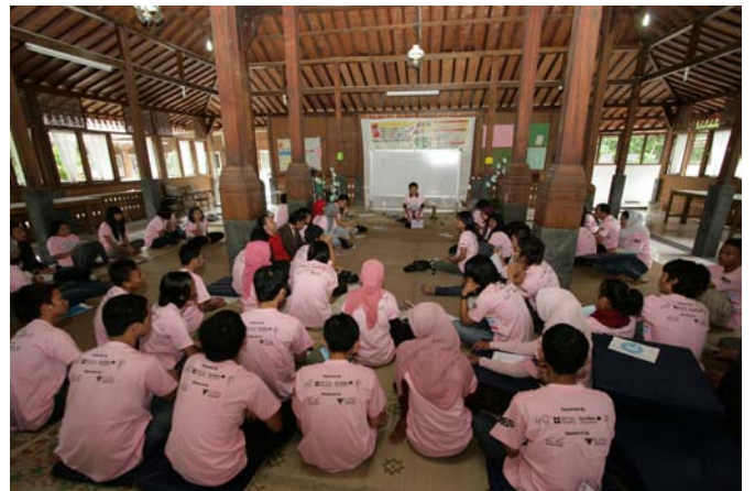
The role of youth in buiding peace and change