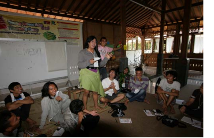
Who Am I