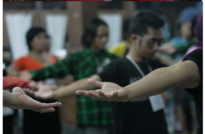
Reflection on self and society through yoga