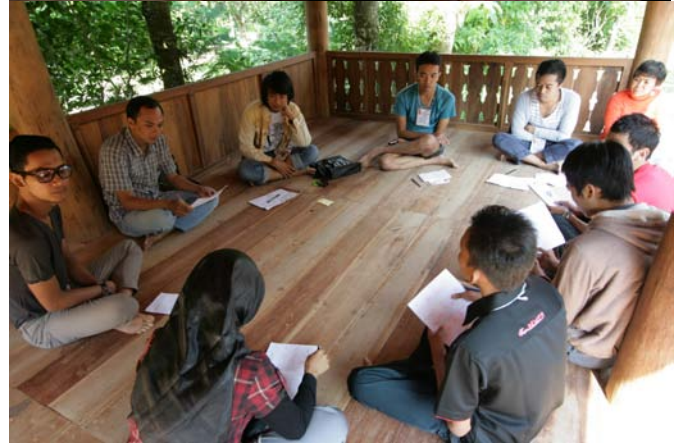
Social location analysis : understanding Self Pyramidal Identities

Day four was started with self pyramid analysis. After participants drew their own pyramid yesterday, they had their forum to share it with others. They had to tell to their group on how those identity pyramids were reflected in their daily life. From group discussions, there were some lesson learned that could be cultivated, such as :