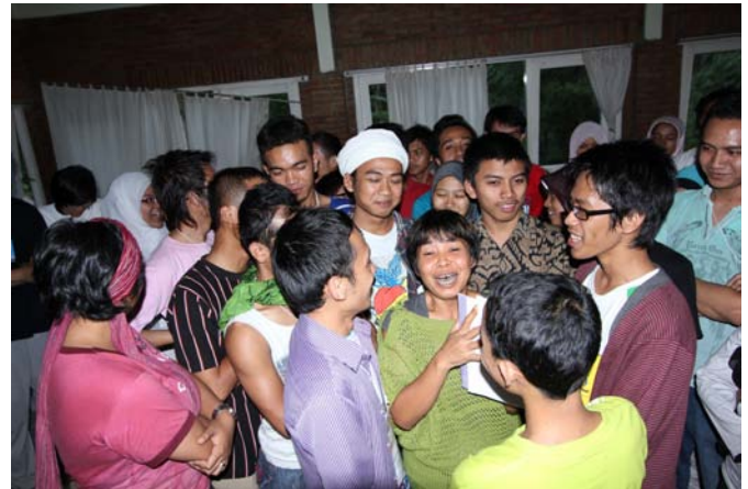
Social location analysis : making Self Pyramidal Identities