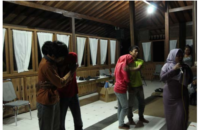
Sketch performance : Primordialism