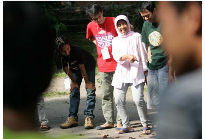
Understanding cross-cut identities through Gay Muslims

Through a documentary film from English television station – Channel 4 titled Gay Muslims , Dodi from Centre for Peace and Security Studies showed some cases on how gay and lesbian moslems in London struggling in integrating their religion and sexuality. Their stories were different, started with their decision to pressure their homosexual identities and had double life and also to come out although they had to loose the respect and support from family and society. This film sharing was reflected through an outdoor activity in which participants walked in a circle and when it came to second walk, they had to change their footwear with the friends in front of her/him. Footwear became the symbol of identity that one felt comfortable with in order to walk his/her journey. However, when someone had to change his/her identity, then there will be an uncomfortable and weird feeling because she/he couldn't be the way who she/he is.