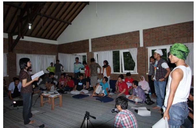
State respond to LGBT and non-mainstream religions

State played important role in protecting its citizen, including minority groups, such as LGBT and non-mainstream religion. The forced cancellation of LGBT event by religious claimed based group through violated actions was one