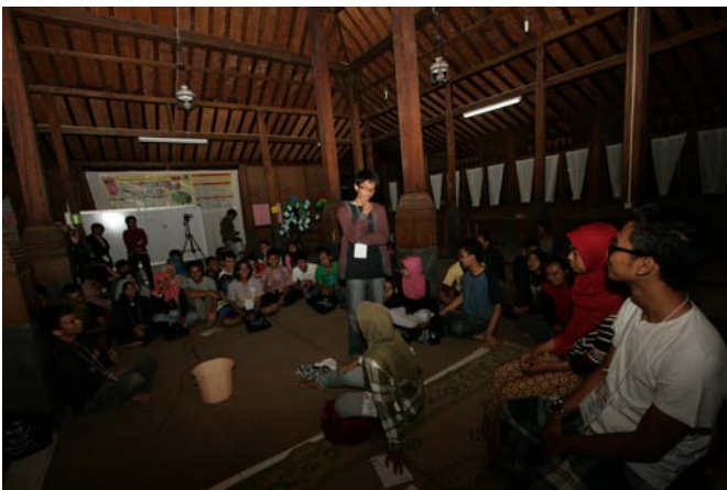
Sketch performance : Subordination