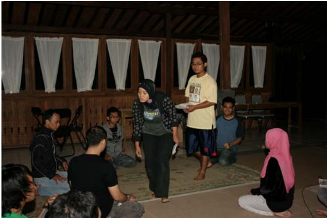
Sketch performance : Acceptance