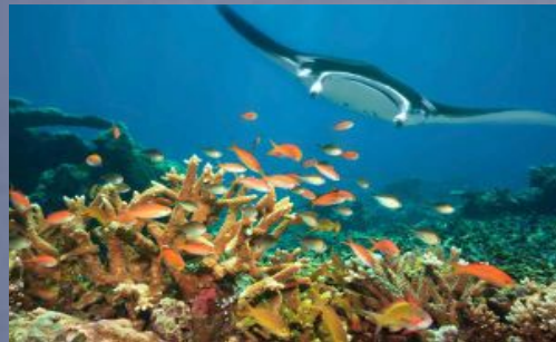
The undersea ecosystem