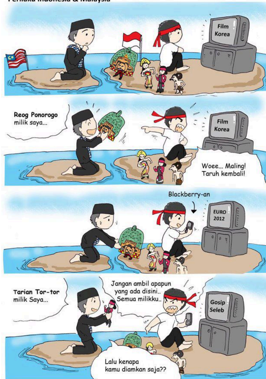
Perilaku Indonesia & Malaysia