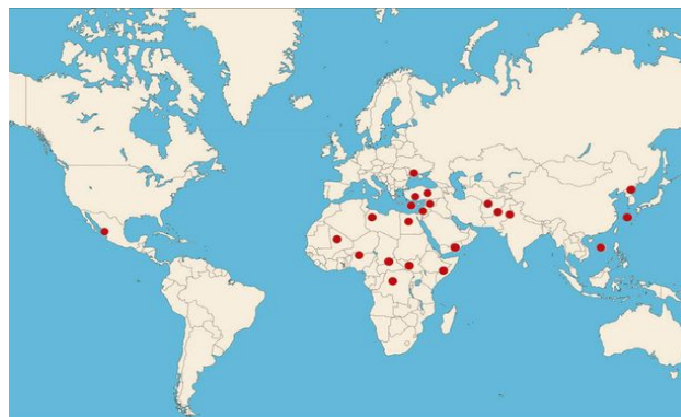
Figure 1. Conflicts around the world threaten the peace in the world: Syria, Afghanistan, Palestine, Mexico, Korean Peninsula, Yemen, Iraq, Kurds, South China Sea, East China sea, Pakistan, Lebanon, Republic of Congo, Somalia, India, South Sudan, Egypt, Central African Republic, Ukraine, Nigeria, Libya, Mali.

and followers choosing their God, wine and women: the vast Expanse of the sea, limitless reach of space, but the limited vision of human mind and the greatness of nature, and the magic of God's will that can control the five elements on Earth.